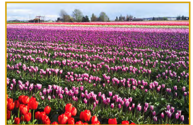
Skagit Valley Tulips