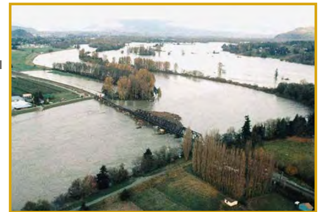
BNSF Skagit River Bridge during Flooding

Projects for Skagit Transit’s new maintenance, operations, and administration base do not have identified environmental constraints, as the footprint of the existing structure that will become the base is not anticipated to substantially change. The Peterson Road projects have potential identified environmental constraints.