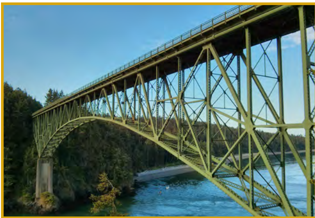
Deception Pass Bridge to Island County

This environmental constraints assessment can also help the Transportation Policy Board and their members agencies identify the