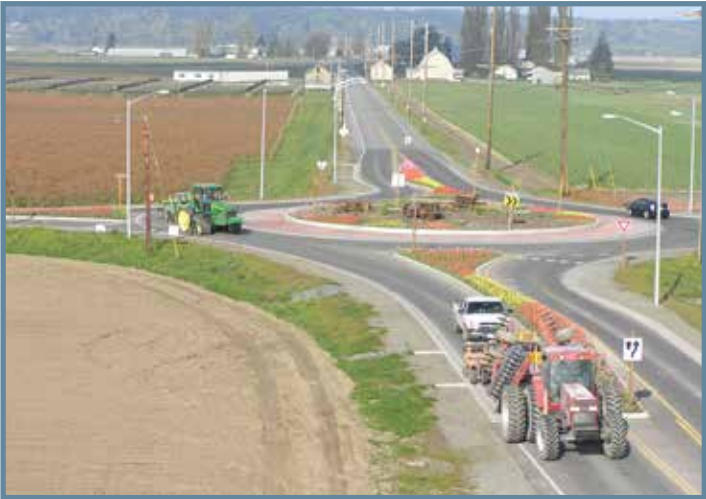
Roundabout in Skagit Valley