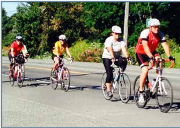
Bicyclists in Skagit County

The FAST Act, similar to past federal surface transportation laws, requires the MTP to be based on a 20-year forecast period. Additional requirements for an MTP include relevant to Skagit 2045 include: