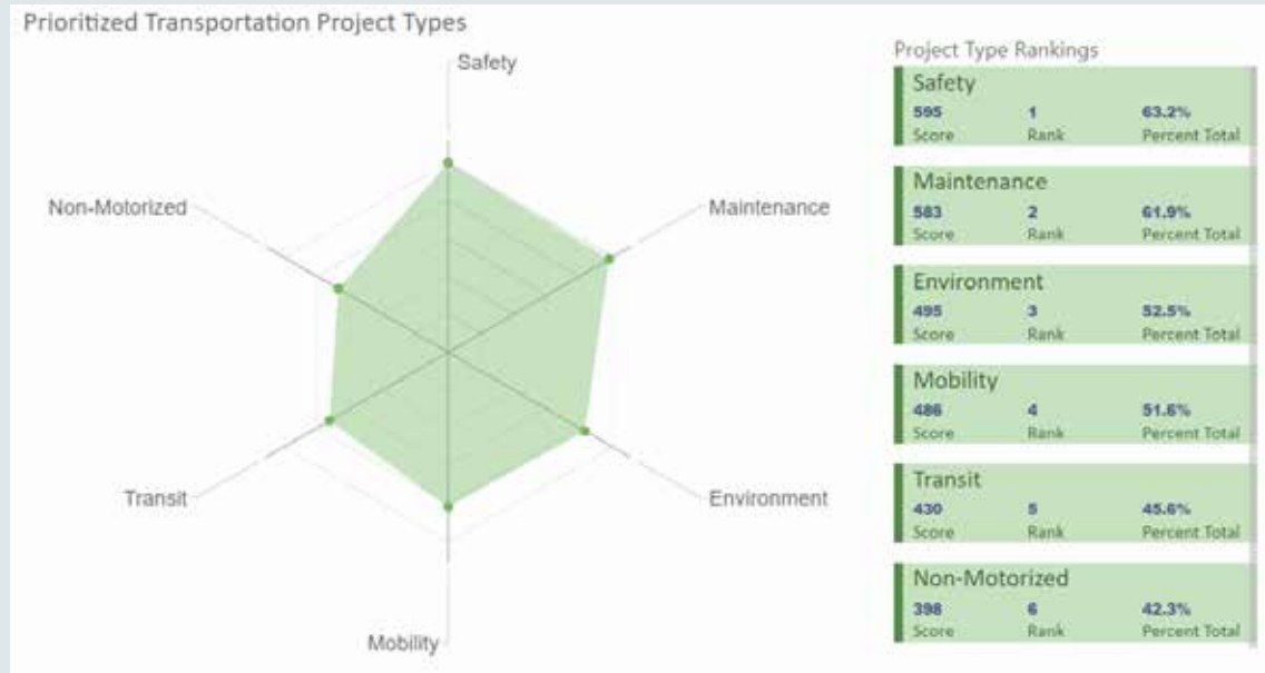
Exhibit 2-2 Public Prioritization Exercise for Project Types