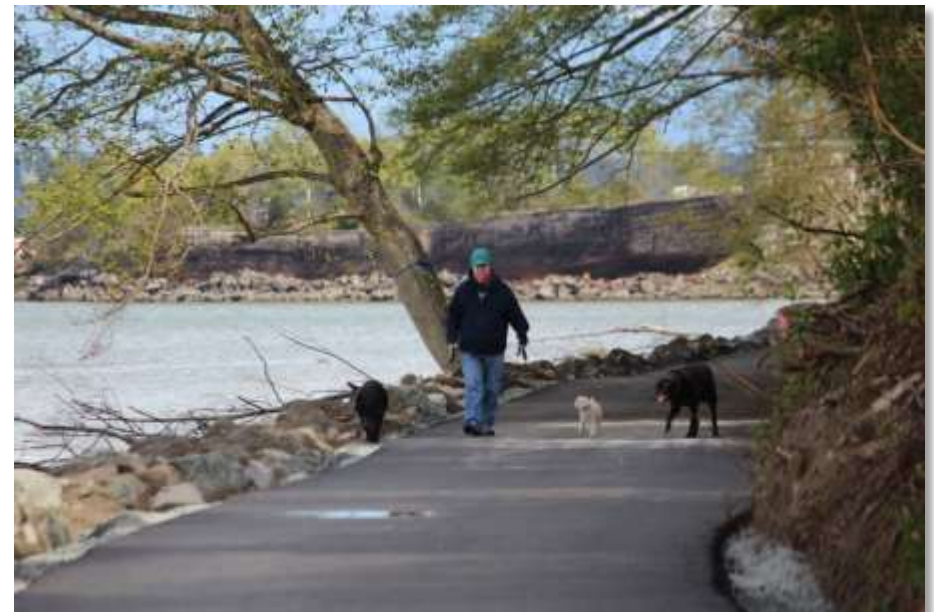
FIGURE 2: THE GUEMES CHANNEL TRAIL IN ANACORTES WAS COMPLETED IN 2015.

The annual listing of federal obligations starting on page 3 includes all projects that obligated federal funds within the Skagit region in 2015. The listing also includes the total amount of federal funding that was programmed for the project in the Statewide Transportation Improvement Program (between 2015 and 2018) and the remaining amount available for future phases of the project. The listing on page 8 details the project closures and de-obligations that occurred in 2015.