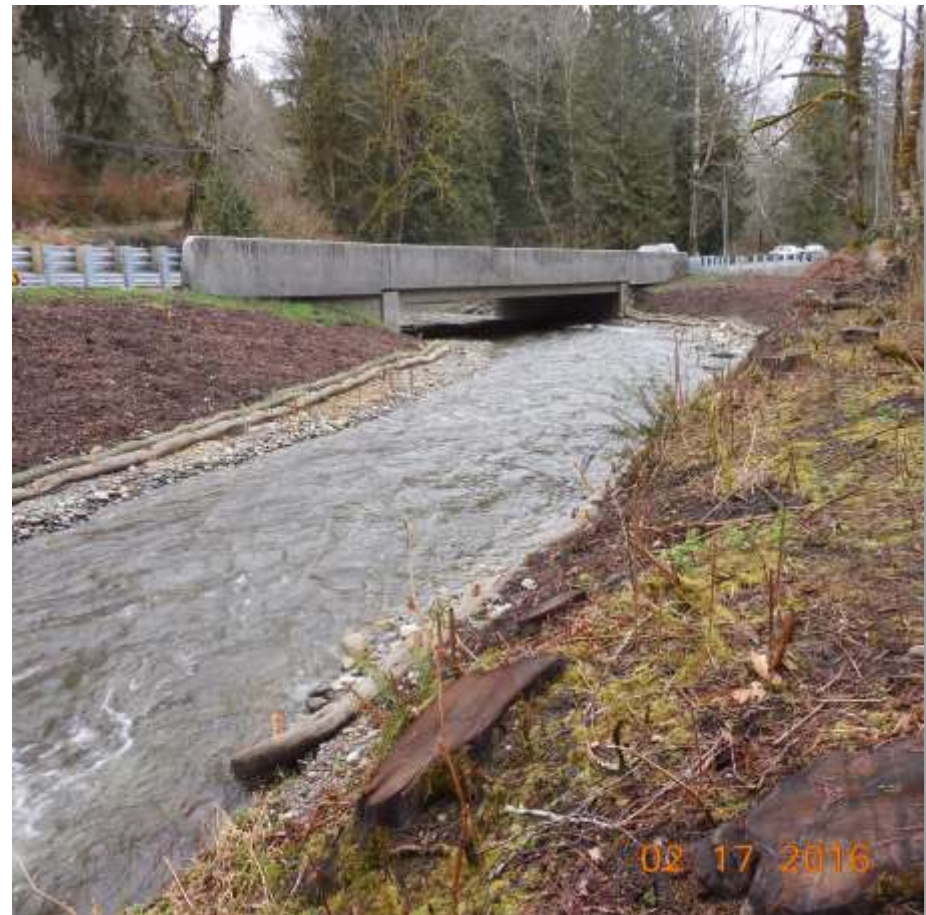
FIGURE 3: WSDOT’S SR 9/LAKE CREEK FISH PASSAGE PROJECT WAS COMPLETED IN 2015.

delayed because all of the funds necessary to complete the project had not yet been secured. Also, WSDOT Marine’s SR 20 Spur/Anacortes Terminal Tie-up Slips – Dolphin and Wingwall Re-