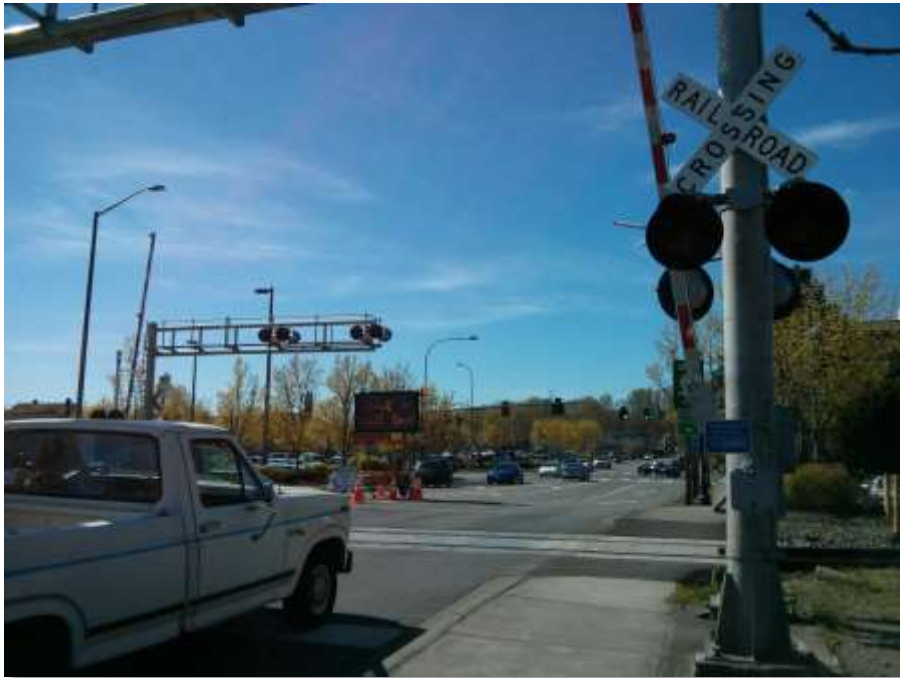
FIGURE 1: OVER $250,000 WAS OBLIGATED FOR THE DESIGN OF KINCAID STREET RAILROAD CROSSING IMPROVEMENTS IN 2015

Federal regulations ( 23 CFR 450.332 ) require SCOG, in cooperation with Skagit Transit and WSDOT, to develop and publish a listing of projects within the Skagit region for which federal transportation funds were obligated during the preceding program year. The Annual Listing of Federal Obligations must be published and made available no later than 90 days after the program year concludes. In Washington State, the program year generally follows the calendar year, which means