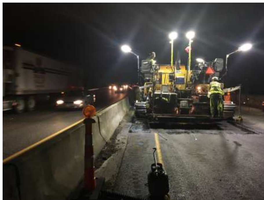
FIGURE 2: WORK BEING DONE ON THE I-5 NB HILL DITCH BRIDGE TO JOE LEARY SLOUGH PAVING PROJECT.

The annual listing of federal obligations starting on page 3 includes all projects that obligated federal funds within the Skagit region in 2016. The listing also includes the total amount of federal funding that was programmed for the project in the Statewide Transportation Improvement Program (between 2016 and 2019) and the remaining amount available for future phases of the project. The listing on page 7 details the de-obligations that occurred in 2016.