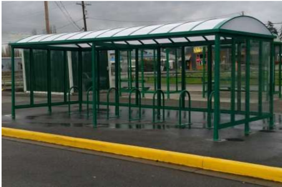
FIGURE 1: SKAGIT TRANSIT OBLIGATED NEARLY $10,000 IN TRANSPORTATION ALTERNATIVES PROGRAM FUNDING FOR THE MARCH POINT BIKE SHELTER IN 2016.

Federal regulations ( 23 CFR 450.332 ) require SCOG, in cooperation with Skagit Transit and WSDOT, to develop and publish a listing of projects within the Skagit region for which federal transportation funds were obligated during the preceding program year. The Annual Listing of Federal Obligations must be published and made available no later than 90 days after the program year concludes. In Washington State, the program year generally follows the calendar year, which means the Annual Listing of Federal Obligations must be published by the end of March each year.