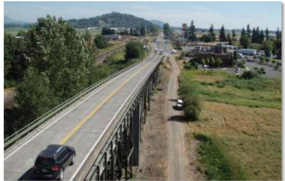
FIGURE 3: SKAGIT COUNTY'S BNSF BRIDGE REPLACEMENT PROJECT IS EXPECTED TO BE COMPLETED IN SPRING 2018.

This report indicates that approximately $25.2 million in federal funds were obligated for transportation projects in the Skagit region in 2016. However, around $30.2 million in federal funds were programmed to be obligated during the same period. The amount obligated during a program year can differ than the amount programmed due to project delays and other administrative challenges. As an example, Skagit County's Skagit River Bridge Modification and I-5 Protection project, which was programmed to obligate $1.2 million in federal demonstration funds, was delayed because the preliminary engineering phase was not completed soon enough to obligate funds for the construction phase in 2016.