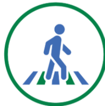
Regional Safety Action Plan