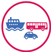
Regional Transportation Plan